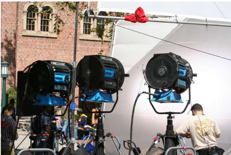
FIG 2. A location shoot for another Colossal production.