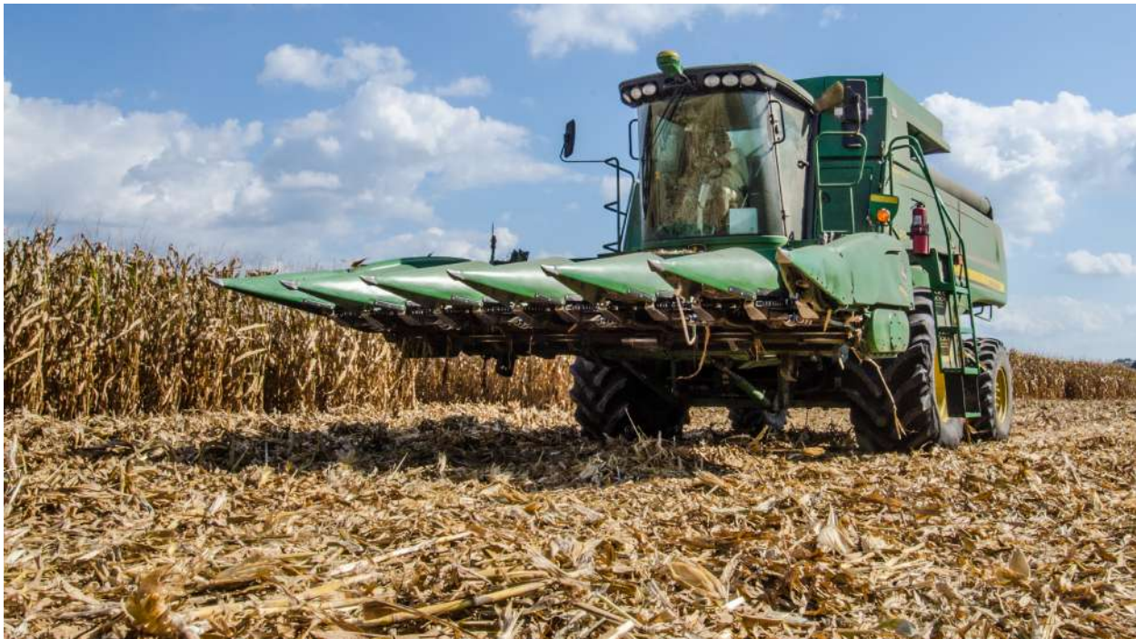
FIG 1. A combine harvester in a cornfield.