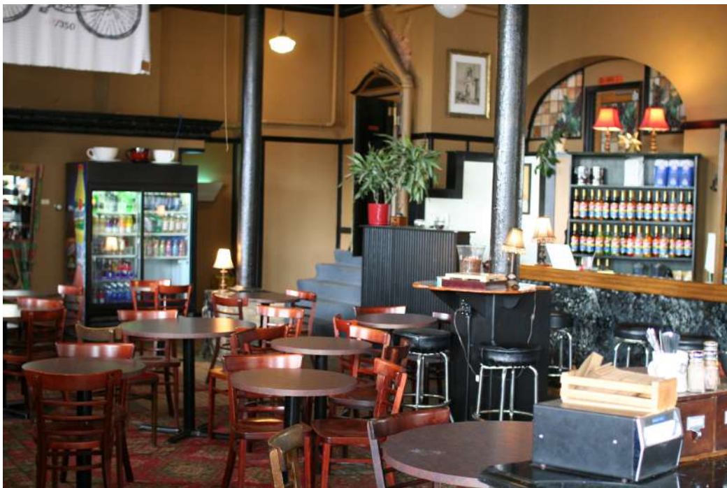
FIG 3. Centralside Café hosts an open mic for amateur singer-songwriters on Tuesdays.