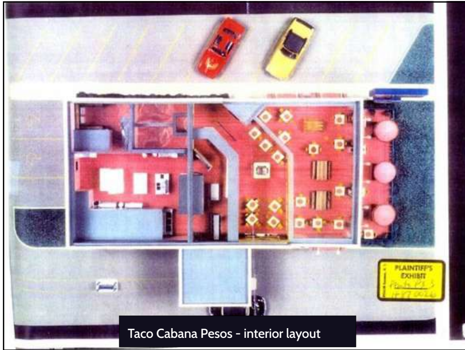
Taco Cabana Pesos - interior layout